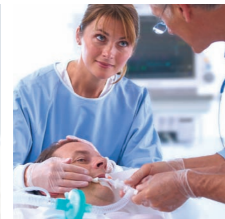
Acute care ventilation from noninvasive to invasive