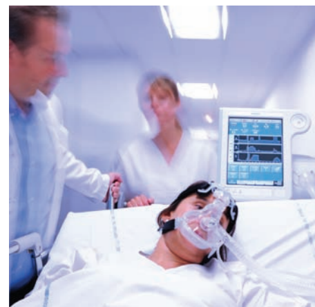
Intra-hospital transport with internal 6-hour battery