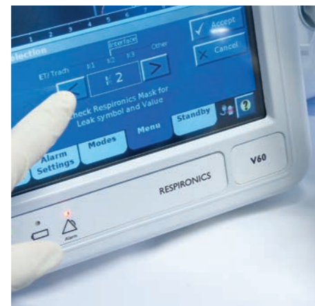
Easy mask and port setup