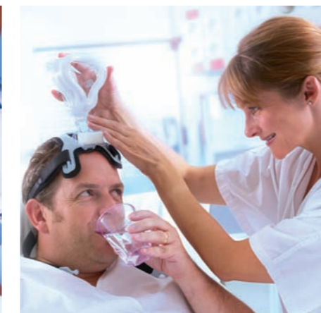
Standby mode for patient-clinician interaction