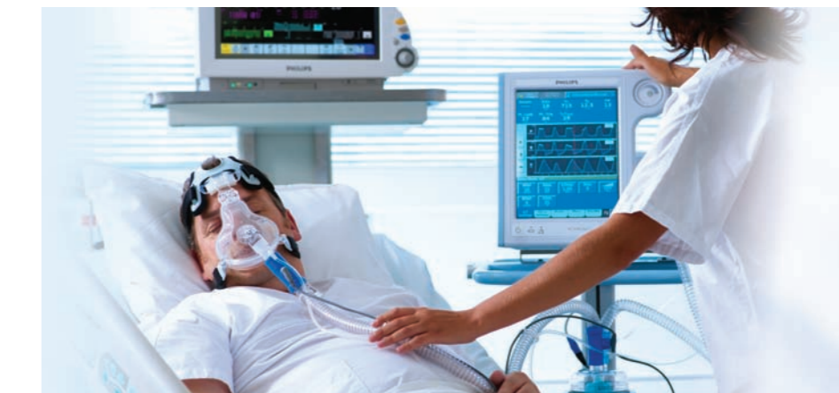
Long-term ventilation with AVAPS and PCV