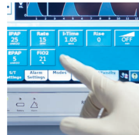
Simple setup with large touchscreen controls